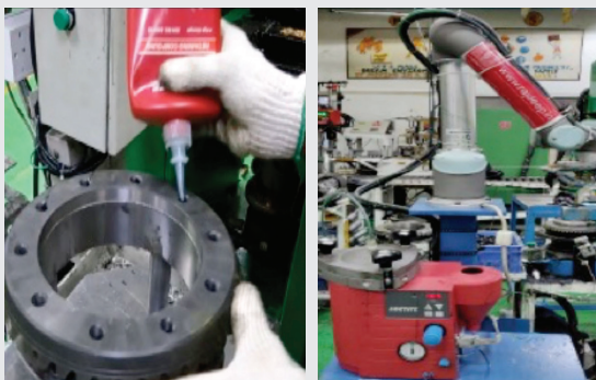
Loctite sealant application: manual versus cobot

The introduction of cobots also led to multiple benefits in terms of increased quality and productivity, thus contributing to fostering the competitive performance of the M&M plant in Kadndivali (India). The cobots considerably improved the efficiency and quality of sealant application. The sensor mounted on the cobot's arm ensures precise location of part holes. The quantity of sealant dispensed in each hole of the ring gear is pre-programmed, thus ensuring